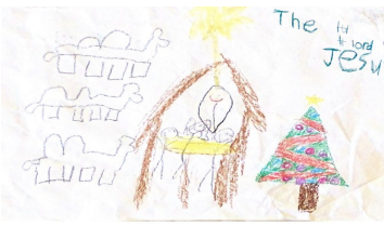
Aurora Claire Simonsen